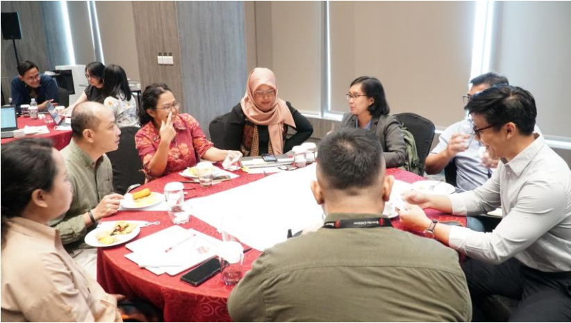
Participants discussing the assigned questions with their respective groups during the FGD session