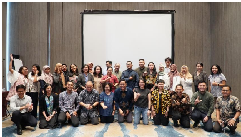
Photo session with participants after the event