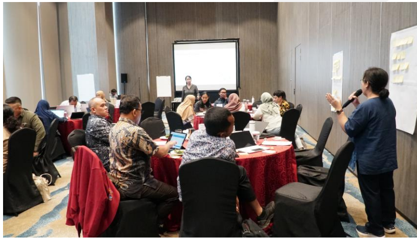
Sharing session on the FGD results by the groups